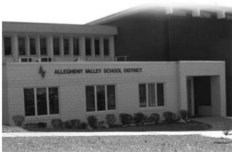
In the District... The District celebrates its students by recognizing three Future Famers... Story on page 5