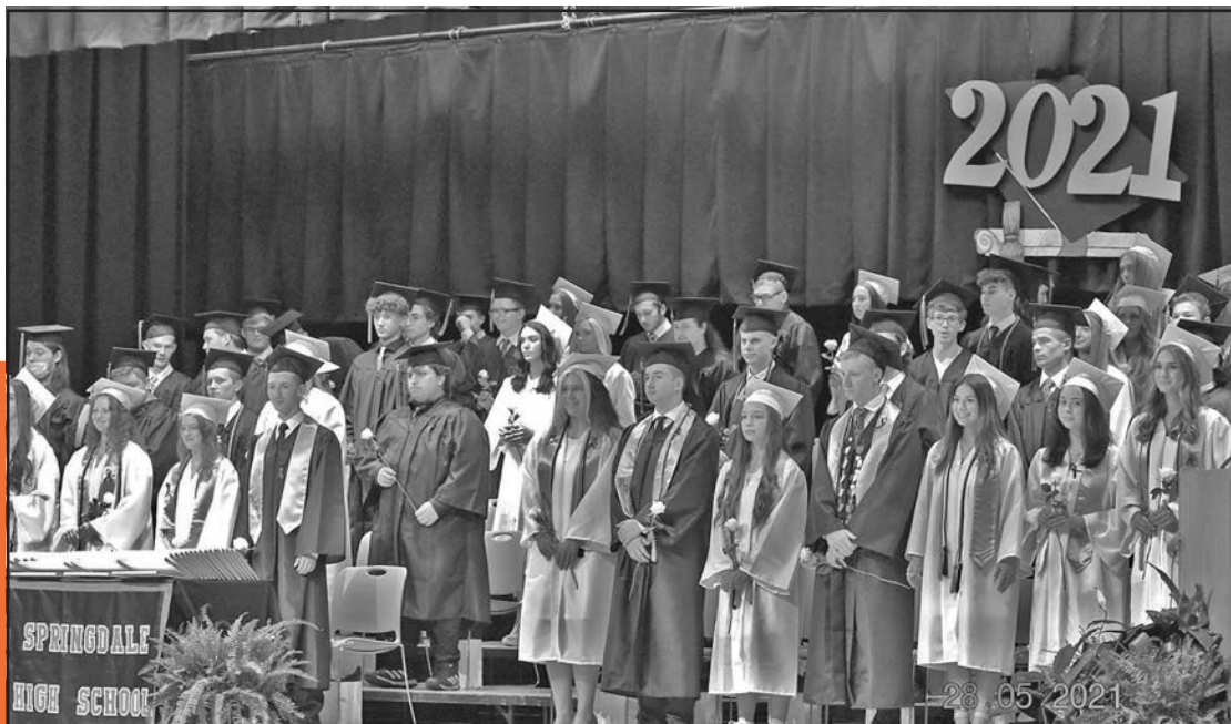
Congratulations to the Springdale Jr-Sr High School Class of 2021. Sixty-one students participated in their graduation ceremony on Friday, May 28. Story on page 2; highlights of the class are listed on pages 6-7.

Pg. 15 The Dynamo Education Foundation continues to raise money for grants... Story on page 15.