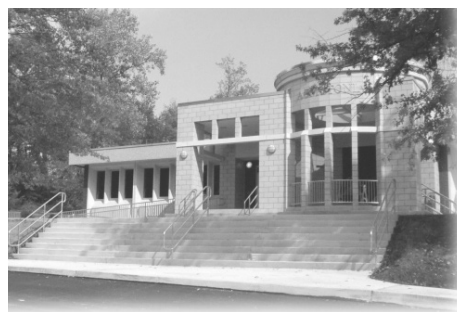
At Acmetonia Elementary... Students participated in the Children's Choice event... Story on page 4