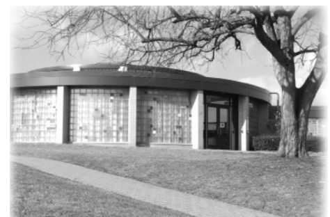
At Springdale Jr-Sr High School... The District found a special way to celebrate SHS seniors... Story on page 7.