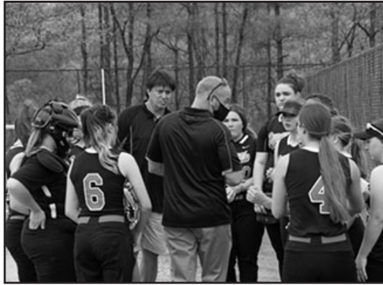
The SHS Softball team advanced to the WPIAL playoffs in 2021.