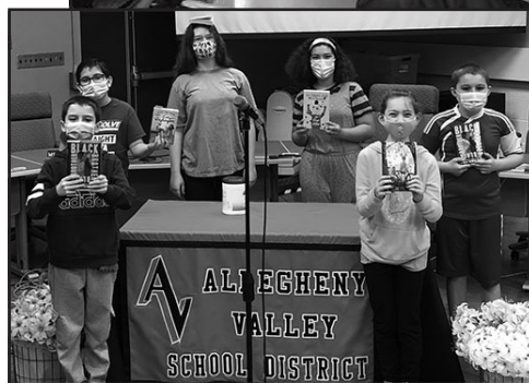
Acmetonia Elementary students discuss their favorite books in the Children's Choice program.

On Thursday, May 6th, students from Acmetonia Elementary School participated in the Allegheny Intermediate Unit and Allegheny County Library Association Children's Choice event featuring books published in 2020.